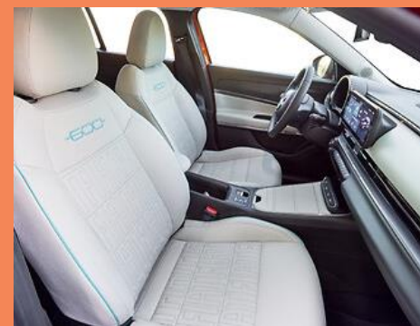
Standard Upholstery Full Ivory Fiat Monogram Leather Seat Upholstery

All pictures for illustration purposes only