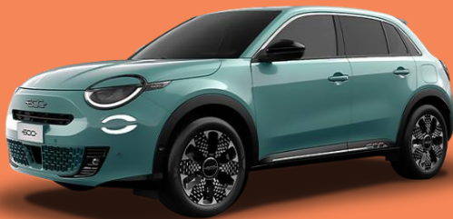
Blue - Sky