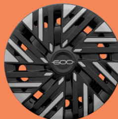
Standard Wheel 16" Steel Wheels with Covers