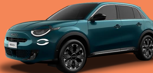
Green - Sea