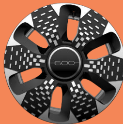
Standard Wheel 18" Alloy Wheels Diamond Cut