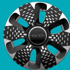
La Prima Standard Wheel 18" Alloy Wheels Diamond Cut