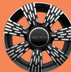
Standard Wheel 17" Alloy Wheels Diamond Cut