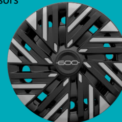
(RED) Standard Wheel 16" Steel Wheels with Covers